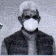
Shri Manoj Sinha Hon'ble Lieutenant Governor